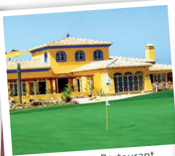
El Torrente Restaurant