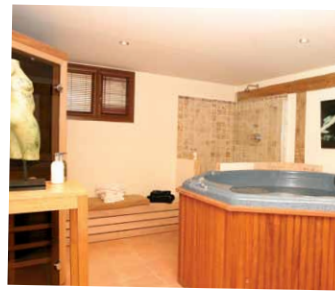
Sauna and Jacuzzi